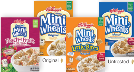
Touch of Fruit Raspberry ✦