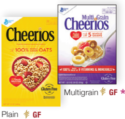
Plain ✦ GF