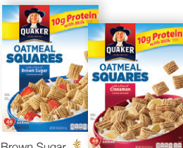
Brown Sugar ✦