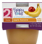
Tippy Toes (4 oz jar or 2-pack, 4 oz each)

NOT ALLOWED: Organic; squeeze pouch; any with added cereal, granola, yogurt; fruit and juice blend; puddings; cobbler; meat or poultry, rice or pasta (for example, dinner, soup or stew); casseroles; creamed vegetables