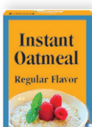
Plain: 🌿 in packets only