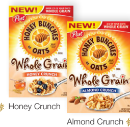
✦ Honey Crunch