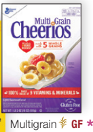
Multigrain ✦ GF *