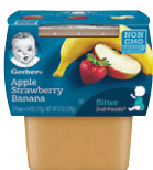
Gerber (2-pack, 4 oz each)