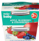
Meijer (2-pack, 4 oz each)