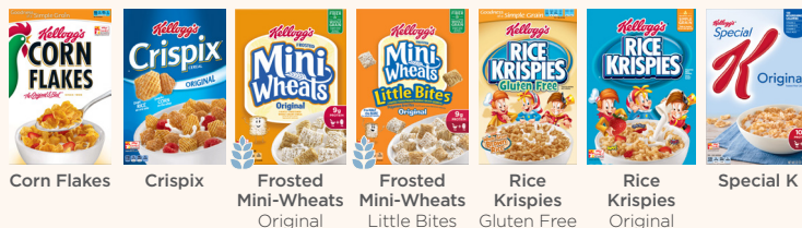
Corn Flakes Crispix Frosted Mini-Wheats Original Frosted Mini-Wheats Little Bites Rice Krispies Gluten Free Rice Krispies Original Special K ✓