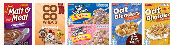
Chocolate Hot Wheat Cereal ✓ CoCo Wheats ✓ Mini Spooners Blueberry or Strawberry Cream ✓ Oat Blenders with Honey and Almond Oat Blenders with Honey