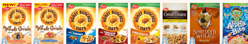
Honey Bunches of Oats Whole Grain Honey Crunch Honey Bunches of Oats Vanilla Bunches Honey Bunches of Oats with Almonds Honey Bunches of Oats Cinnamon Bunches Honey Bunches of Oats Honey Roasted Great Grains Banana Nut Crunch Shredded Wheat Honey Nut Alpha Bits