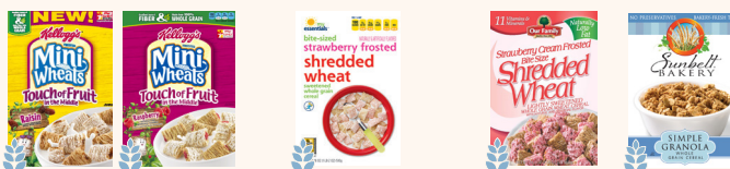
Frosted Mini-Wheats Touch of Fruit Raisin Frosted Mini-Wheats Touch of Fruit Raspberry Strawberry Frosted Shredded Wheat Shredded Wheat Strawberry Cream Frosted ✓ Simple Granola