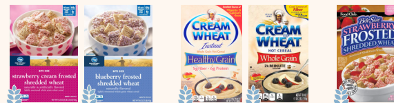
Frosted Shredded Wheat Strawberry Cream ✓ Frosted Shredded Wheat Blueberry ✓ Cream of Wheat Healthy Grain Instant Cream of Wheat Whole Grain 2 1/2 Minute Frosted Shredded Wheat Strawberry Cream