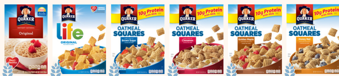
Instant Oatmeal Original only (Ind. packets) Life Original only Oatmeal Squares Brown Sugar ✓ Oatmeal Squares Cinnamon ✓ Oatmeal Squares Golden Maple ✓ Oatmeal Squares Honey Nut ✓