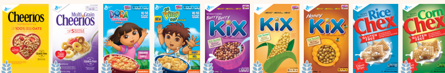
Cheerios Original Cheerios Multi-Grain Dora the Explorer Go Diego Go Kix Berry Berry Kix Original Kix Honey Chex Rice Chex Corn