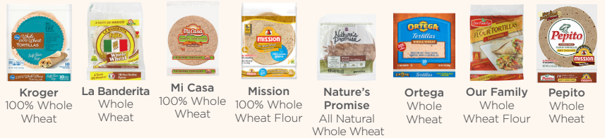
Kroger 100% Whole Wheat La Banderita Whole Wheat Mi Casa 100% Whole Wheat Mission 100% Whole Wheat Flour Nature's Promise All Natural Whole Wheat Ortega Whole Wheat Our Family Whole Wheat Flour Pepito Whole Wheat