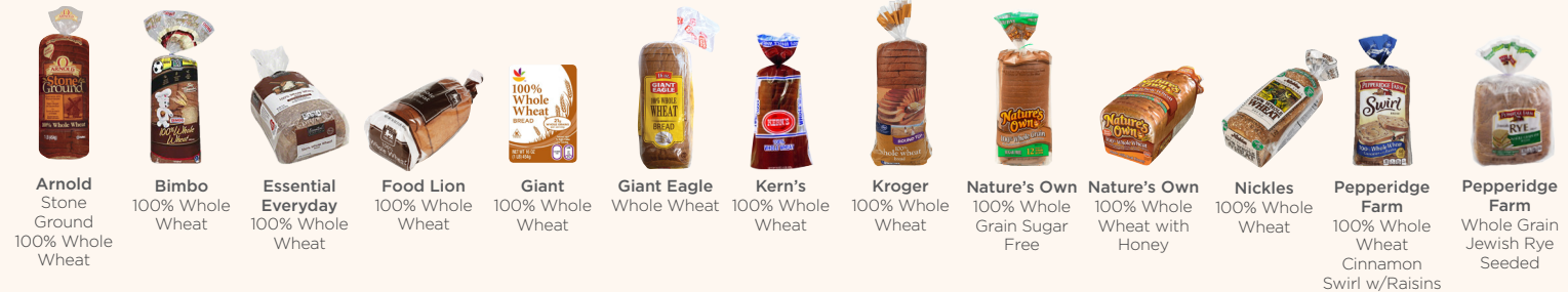
Arnold Stone Ground 100% Whole Wheat Bimbo 100% Whole Wheat Essential Everyday 100% Whole Wheat Food Lion 100% Whole Wheat Giant 100% Whole Wheat Giant Eagle Whole Wheat Kern's 100% Whole Wheat Kroger 100% Whole Wheat Nature's Own 100% Whole Grain Sugar Free Nature's Own 100% Whole Wheat with Honey Nickles 100% Whole Wheat Pepperidge Farm 100% Whole Wheat Cinnamon Swirl w/Raisins Pepperidge Farm Whole Grain Jewish Rye Seeded