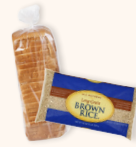
1 loaf of 16 oz. bread and 1 bag of 16 oz. rice