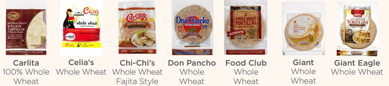
Carlita 100% Whole Wheat Celia's Whole Wheat Chi-Chi's Whole Wheat Fajita Style Don Pancho Whole Wheat Food Club Whole Wheat Giant Whole Wheat Giant Eagle Whole Wheat