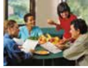
Nutrition and Health Education